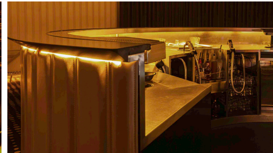
(L-R) Stainless Steel Custom Fabricated Curvilinear Bar Complete with Curvilinear Benchtop and integrated sinks, Stainless Steel Custom Fabricated Circular Round Complete with Benchtop and integrated sinks.