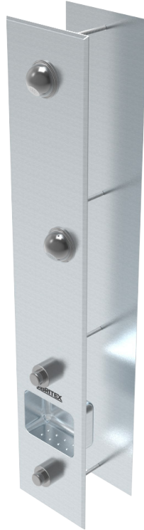
Rear Fixed Model Shown (Front Fixed Model with Security Screws available)