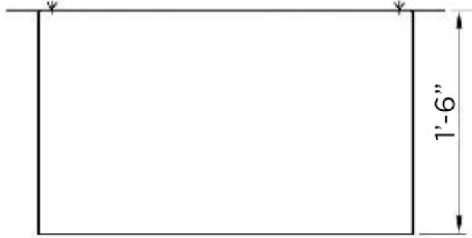
MODEL US-SDW Plan Elevation