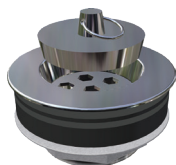
Optional Acid Resistant Grade 316 Stainless Steel Waste Outlet (LSPW)