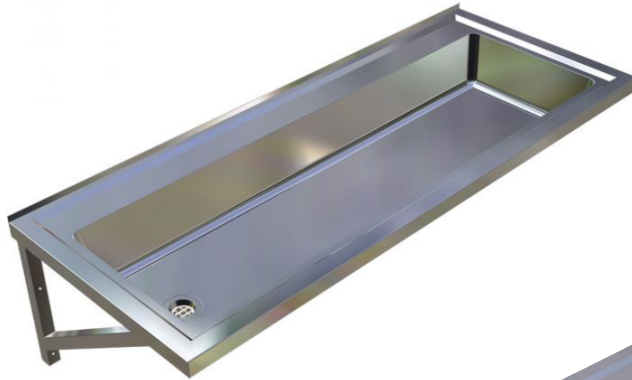
Image shows Model US-TP8-F Wall Mounted Trough with front fascia